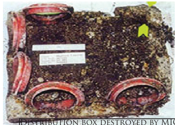
DISTRIBUTION BOX DESTROYED BY MIC

Sewage carries Hydrogen Sulfide ( H_2S ) as a dissolved gas. Agitate it, stir it up, cause some turbulence, and the gas comes out of solution and floats in the air. It smells like rotten eggs. Venting will not stop the reaction. Unless the air is rapidly moving, it cannot carry the Hydrogen Sulfide away. For years, it was the accepted explanation that Sulfurous acid and Carbonic Acid (formed when Carbon dioxide reacts with water) caused the damage seen in septic tanks, distribution boxes, sewer pipes, and manholes. Then somebody discovered Thiobacillus bacteria. These pesky bacteria are aerobic. They require oxygen. They also require Hydrogen Sulfide. They "eat" Hydrogen Sulfide and excrete Sulfuric Acid as a waste. Some of them excrete the acid in greater than 40% strength. Good, solid, concrete is attacked by the acid and crumbles into powder. The worst one, Thiobacillus concretivorium, is named for its appetite for concrete. It does not matter whether it is Type I or Type II (sulfate resistant) cement that makes the concrete. Thiobacilli love the stuff. All